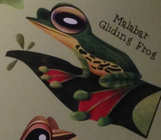
Malabar Gliding Frog