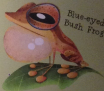
Blue-eyed Bush Frog