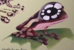
Ochlandra Bush Frog